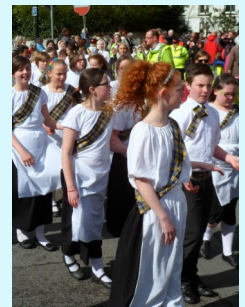
The children's dance starts at 10.15am. The adults dance starts at 2pm