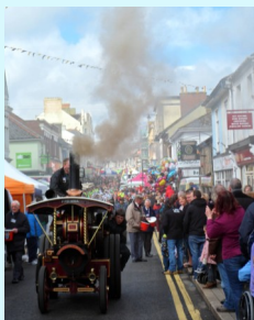
The steam engine parade starts at 3pm The steam engines will leave Camborne past Trevithick's statue at 4.15pm